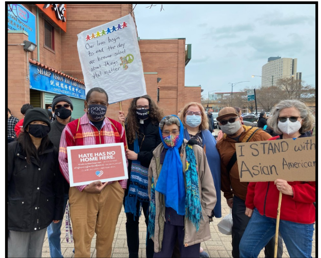
Attending the Stop AAPI Hate Rally in March