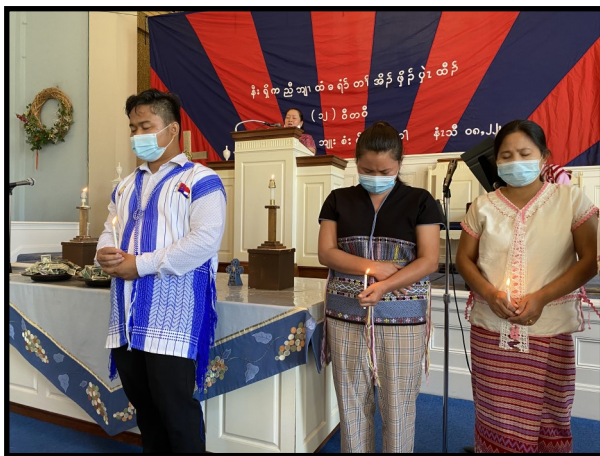
Celebrating the Karen Anniversary in August