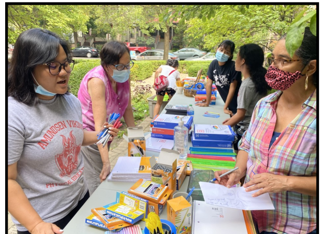
Packing Bags for the Back to School Celebration