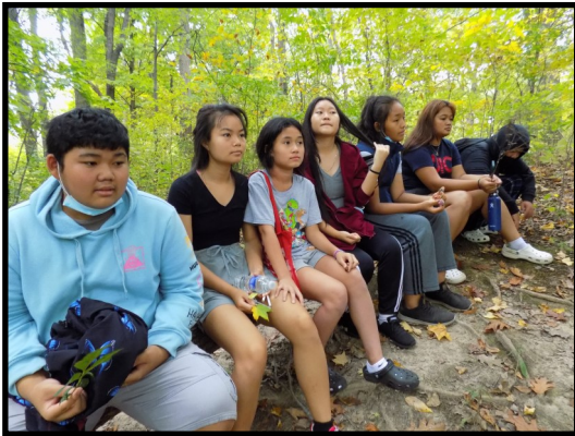
Youth Trip to Waterfall Glen State Park