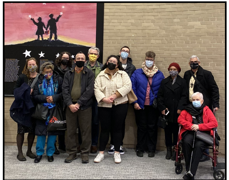
Attending the Hearing in Color event,