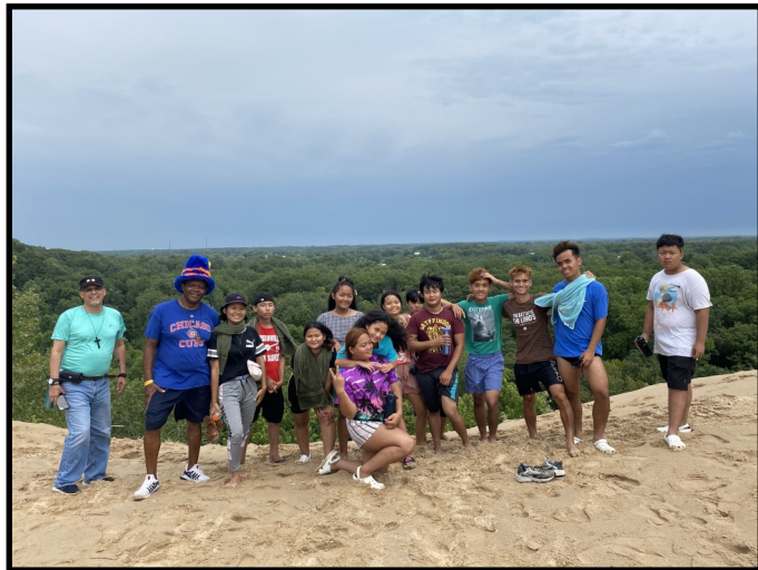
Youth Camping Trip to Warren Dunes, Michigan