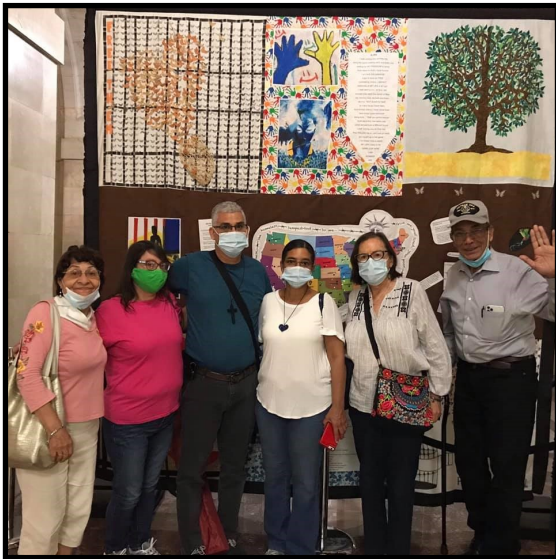
Visiting the 45,000 Quilt Project at City Hall