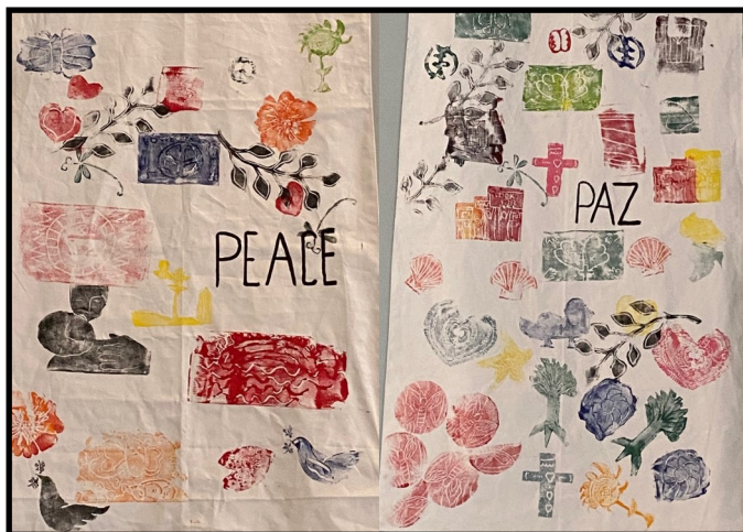
Under the leadership of Viola Mayol, we created our own symbols for a peace banner in September