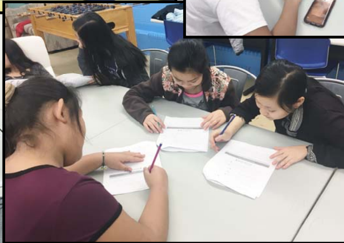
Above & Left: Youth fill out their surveys for the Young Adult Initiative