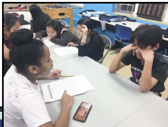
Above & Left: Youth fill out their surveys for the Young Adult Initiative