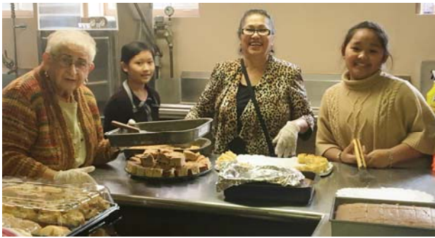
Above: Our youth helped set out tables, prepare and serve food, and direct traffic for the annual ECRA Interfaith Thanksgiving Service. They were a vital part of its success!

This month, we all pitched in to put the new furniture together for the youth room. It is now set up and ready for a fresh coat of paint! Refugee Ministry Assistant Eh Kler also led the youth group in a reflection on thankfulness and remembering all the things for which we are thankful.