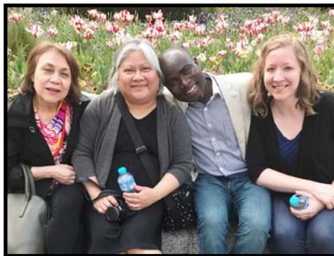
Our Mission Team as they enjoyed a moment of rest in central Salamanca

The ministry, called En Vivo, is a relational ministry for students at the University of Salamanca and the Pontificia University. En Vivo's mission is "amando a los estudiantes, conectando con Cristo" and it lives out this vision through creating service opportunities in the community, Bible study, leadership development, and especially hospitality, providing students a home away from home at its campus house. It was a treasure to experience En Vivo's alternate reality for a week!