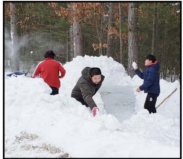
Excellent Plan Youth cook (top, left) and Leaders relax (bottom, left)! Snow Mania (right) Snowball fight while building forts.

In March, we will continue to meet on Friday nights for dinner and fellowship.