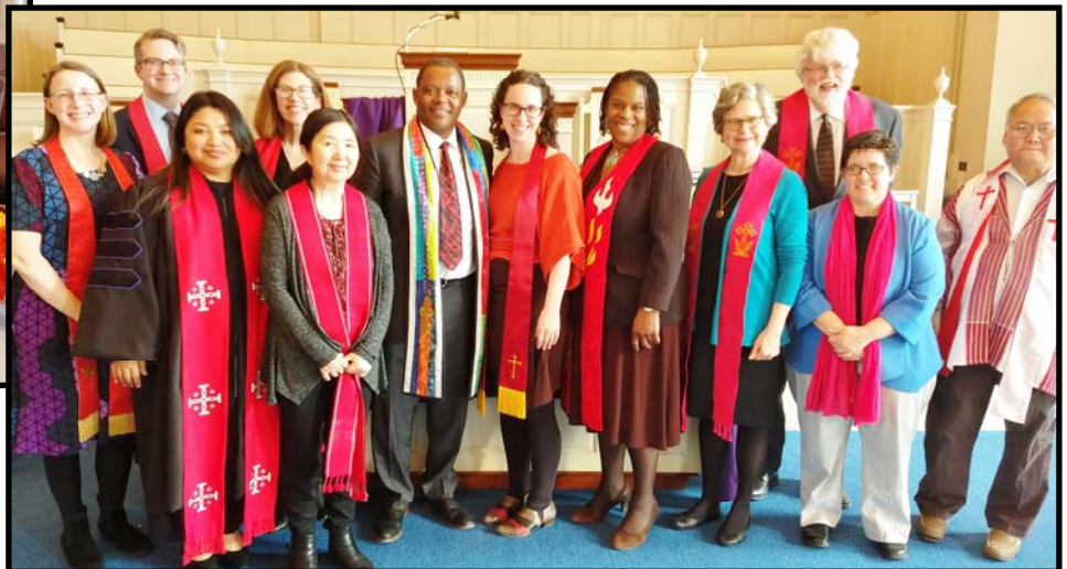
Clergy leaders from throughout the Region help make it a very special day ( right ).