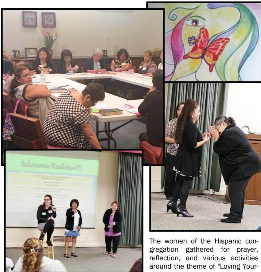
The women of the Hispanic congregation gathered for prayer, reflection, and various activities around the theme of "Loving Yourself a Little More... Woman, You are Free!"