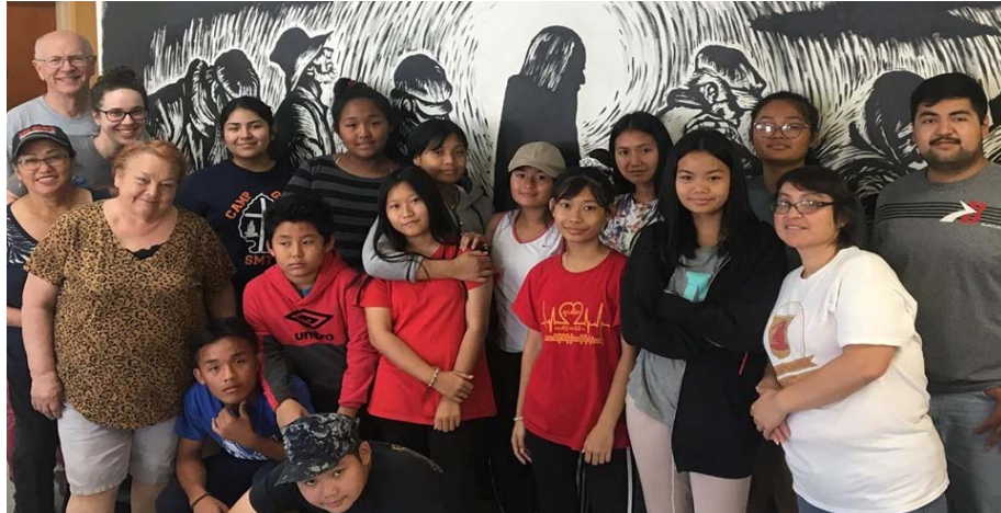
From August 3-8, an intergenerational team performed mission & service projects in Dubuque, IA.