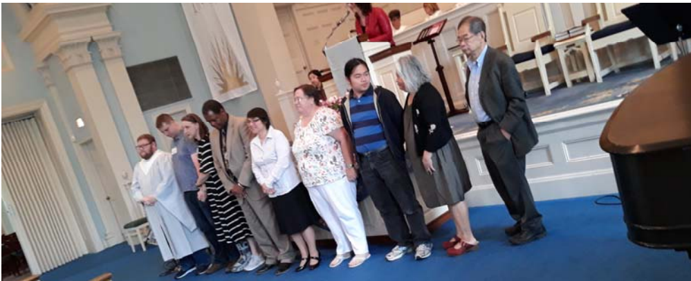
Missionaries and delegates commissioned at joint worship in May.